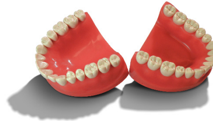
ModuPRO One | Refill Kit Item # MP_R300

Designed to fit to the most common simulation systems where a hinged articulator is not necessary. Packaged in a durable professional aluminum case for transporting ease.