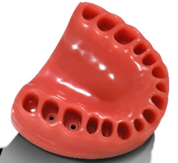
ModuPRO One Replacement Mandibular Soft Gum

ModuPRO One maxillary replacement soft-gum base. Ready for installation of M300 Series teeth.