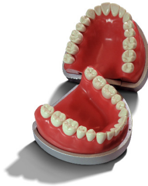
ModuPRO One | Manikin Item # MP_R310

Includes innovative self-adjusting articulator for effortless calibration and lateral and protrusive movement. Packaged in a durable professional aluminum case for transporting ease.