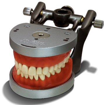
ModuPRO One w/ adjustable articulator Item # MP_R320

Includes innovative self-adjusting articulator for effortless calibration and lateral and protrusive movement. Packaged in a durable professional aluminum case for transporting ease.